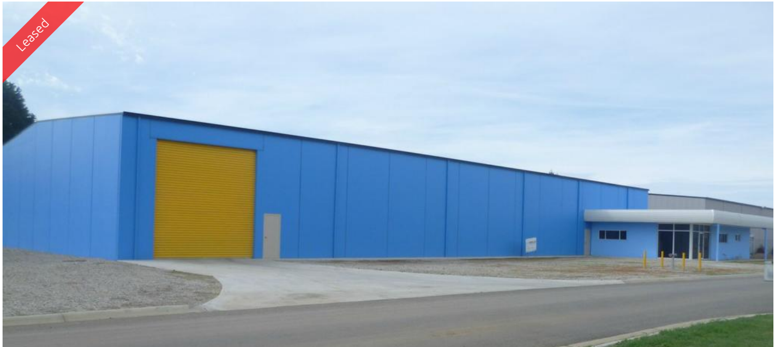
Shed 9 Mentay Way, Mitchell Park