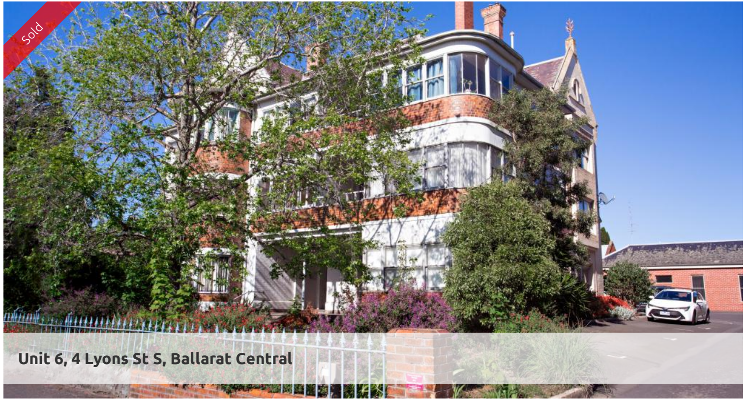
Unit 6, 4 Lyons St S, Ballarat Central