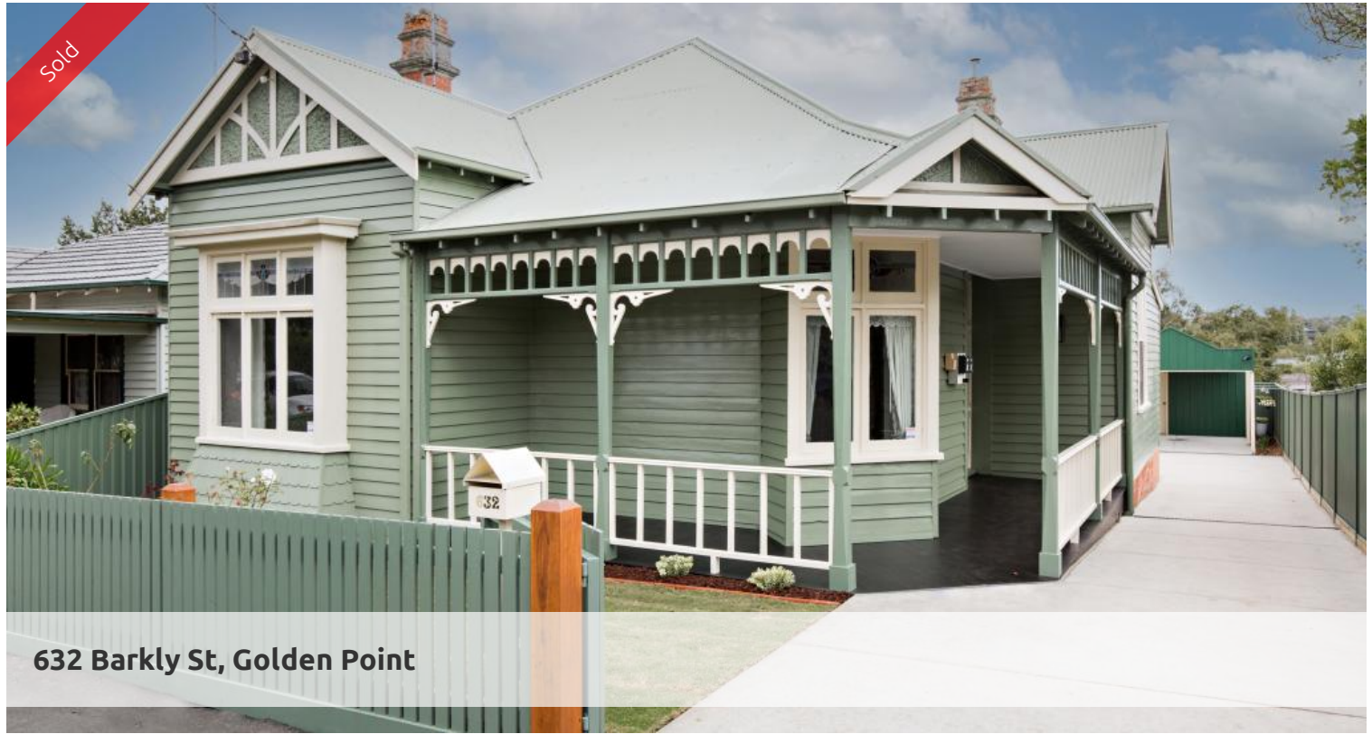
632 Barkly St, Golden Point