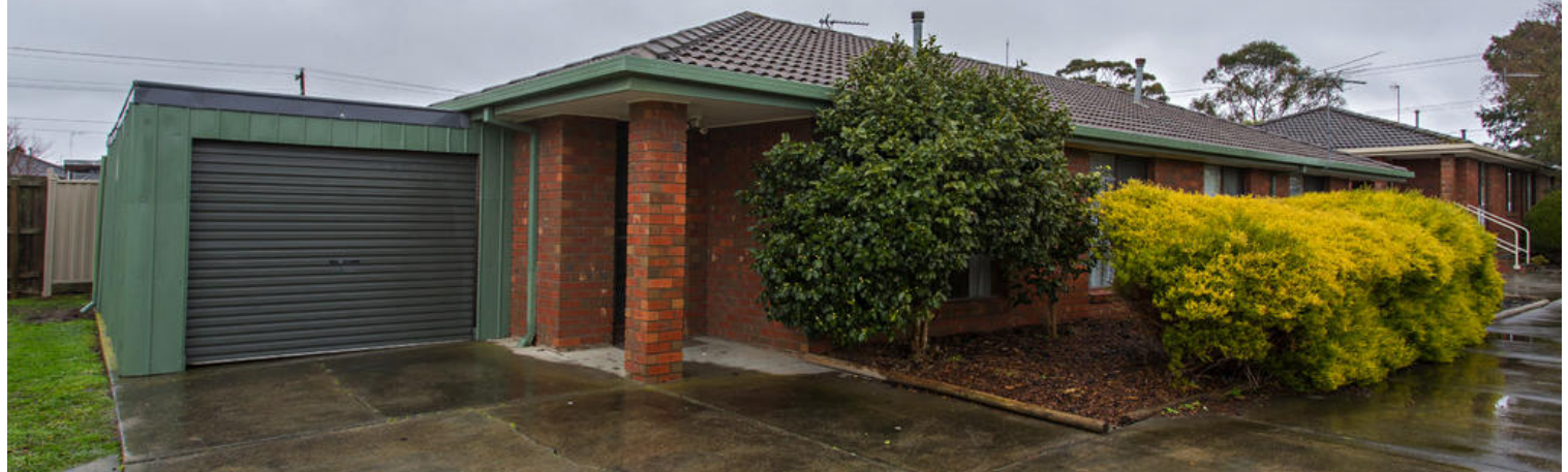
Unit 4, 416 Forest St, Wendouree