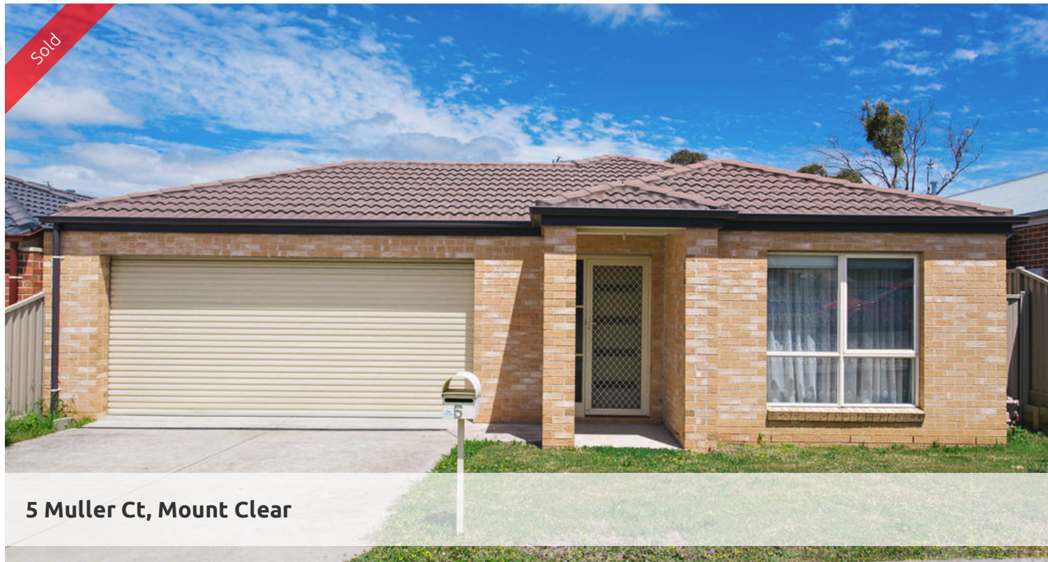
5 Muller Ct, Mount Clear