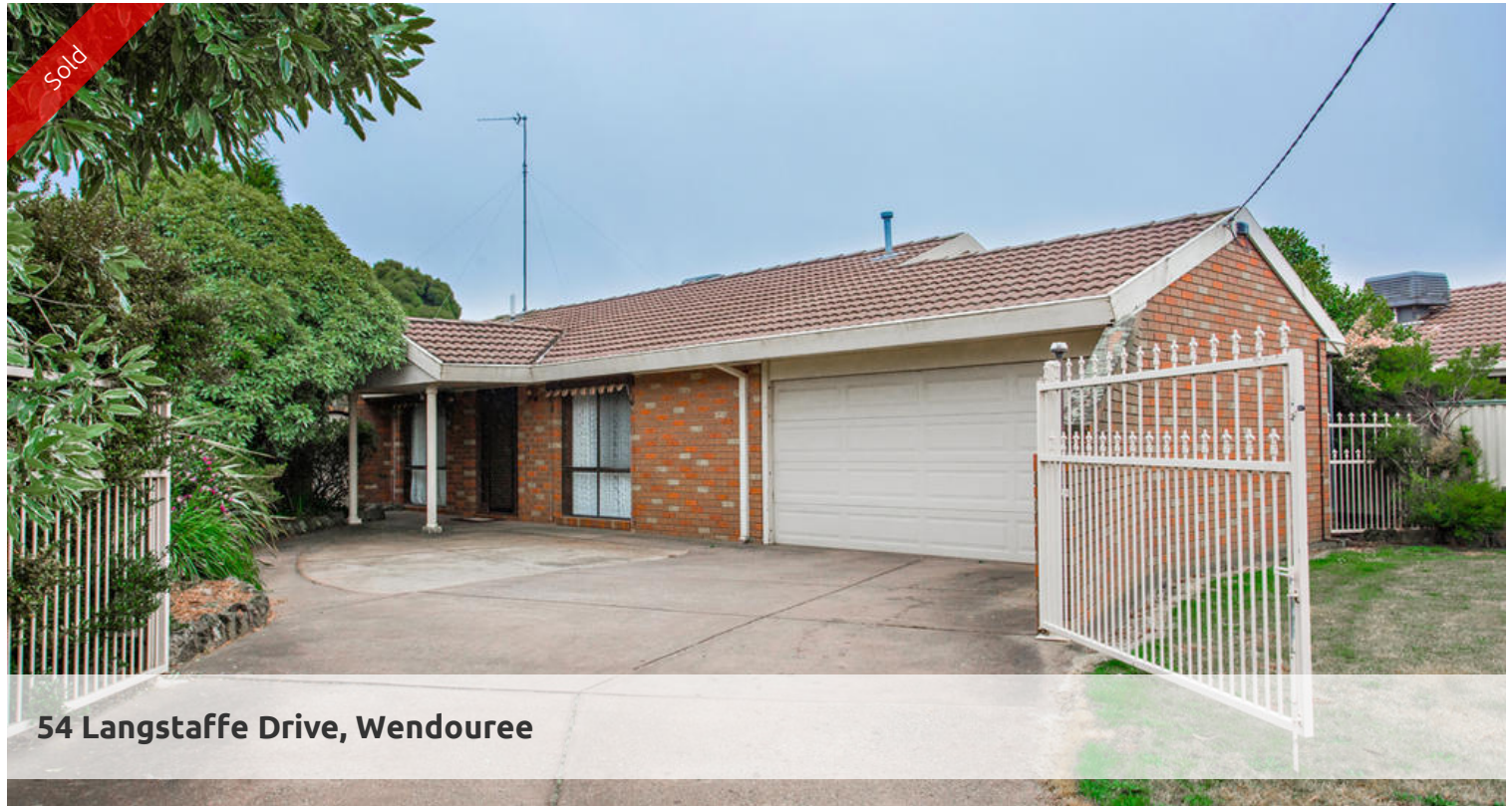
54 Langstaffe Drive, Wendouree